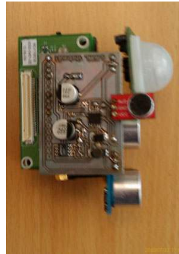
Fig. 4 Multisensor radio mote for room monitoring

After appliances are “recognized” by the system in this way, the operation of the energy management system (requiring the monitoring of the actual state of the appliances in real-time) can still rely on sensor-based interfaces