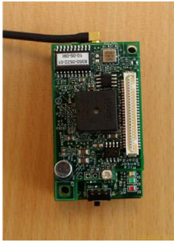
Fig. 3 Multisensor radio module for device monitoring